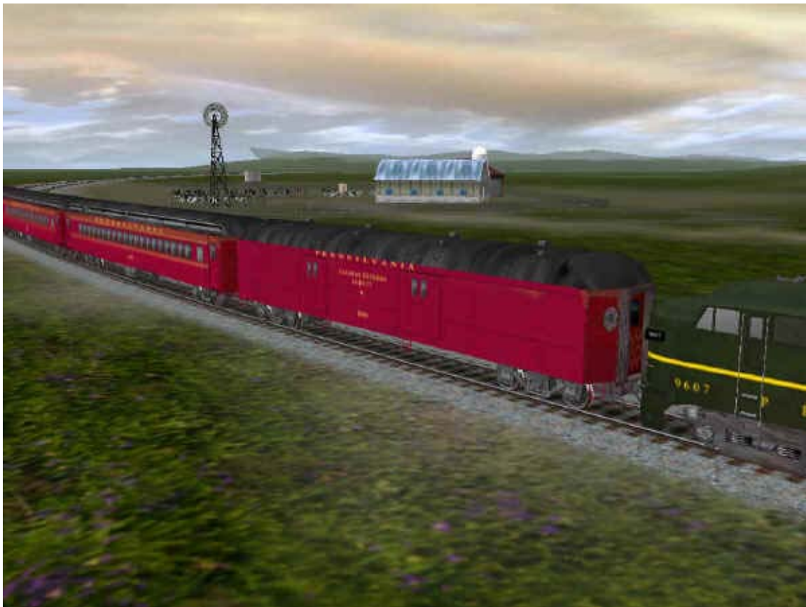
Pennsylvania heavyweight cars, complete set.

W hen Trainz first came on the scene, I was amazed at what a great program it was; and I am STILL amazed at how the folks at Auran put together such a great programming package. When I started using Trainz in the beginning I did miss one type of passenger, car and this was the heavyweight passenger car. The heavyweights were the mainstay of the railroads from the '20s through the '40s. After the lightweight and streamlined cars came on the scene the heavyweight cars continued to perform their duties in local and commuter runs well into the later years. They had lots of character, and I enjoyed traveling in them during the '40s. I missed seeing the old heavyweight Pullman coaches and I really wanted to see them running in Trainz. Finally, after numerous people had posted messages at the Trainz forum and at Trainz-Luvr asking for these cars, Jeff Barr came to the rescue. Jeff Barr, also known as Magicland, created beautiful sets of heavyweight cars with Pennsylvania Railroad lettering and colors. He made the cars