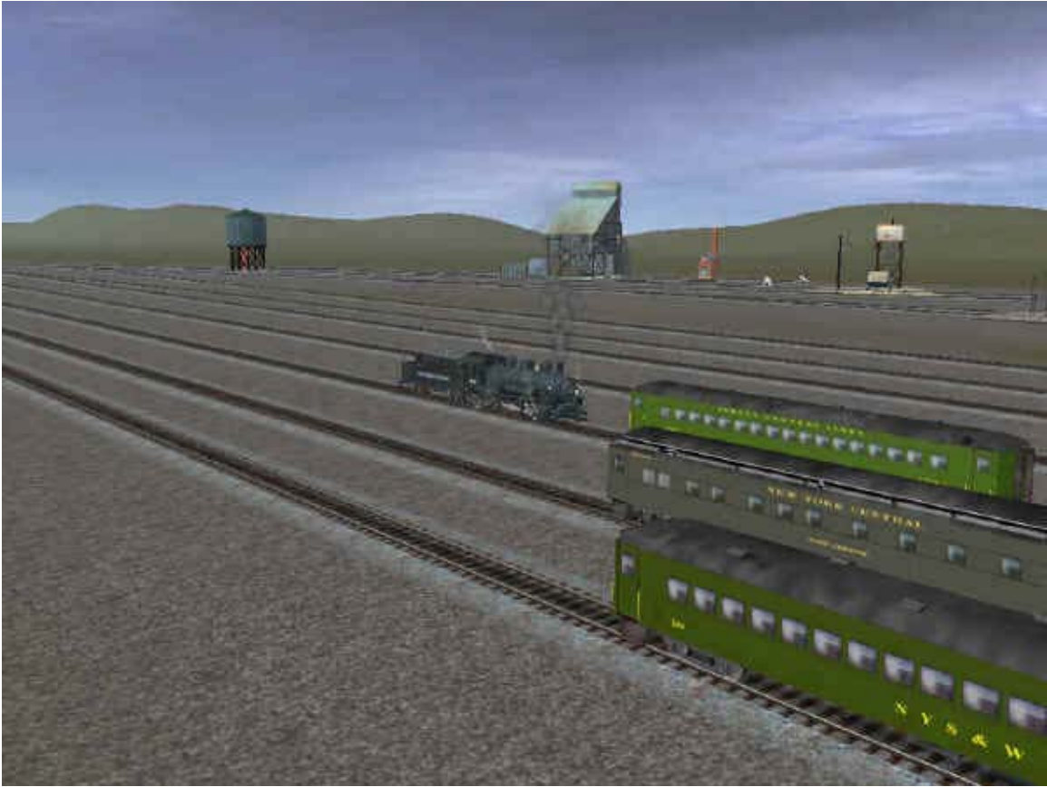
A group of heavyweight coaches, single cars.

In addition to the NYC coach, there are available coaches for the New York Susquehanna & Western Railroad, KUID 45588:10011 and KUID 45588:10112; and the Jersey Central Railroad, KUID 58843:253.