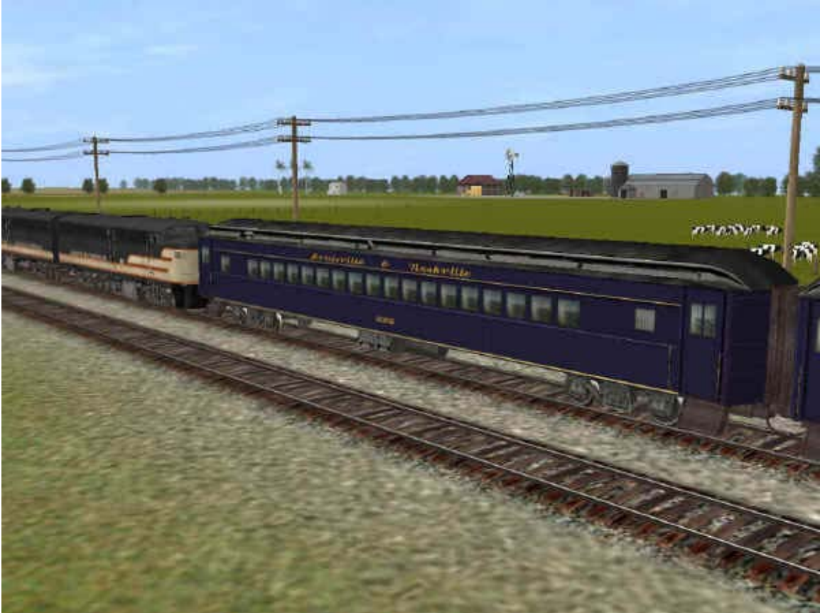
Louisville & Nashville Railroad heavyweights, complete set.