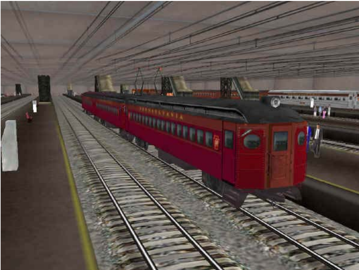
Pennsylvania Railroad MP54 cars.